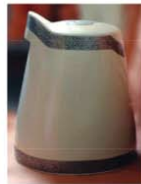
A large glass vessel used as a model with silver finish in black base. The model can be altered for storage and easy transportation