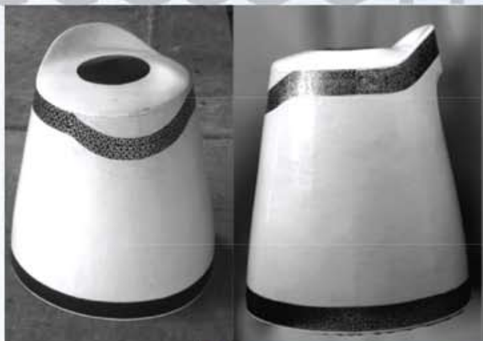
Integrated design and technical design process with prototyping